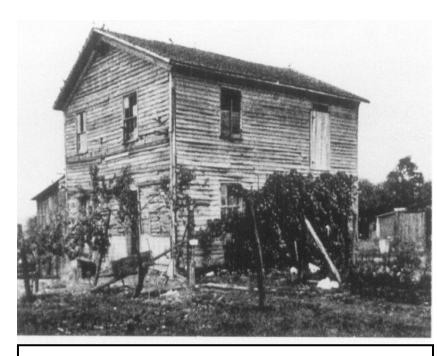
Remains of Ottoville's first church used until 1862. Mass was held on the top floor and the bottom floor served as shelter for newly arrived immigrants and travelers.

right. Ottoville sounded much better. Maria's attention focused on the falling snow and to that dreadful, snowy morning three days earlier.